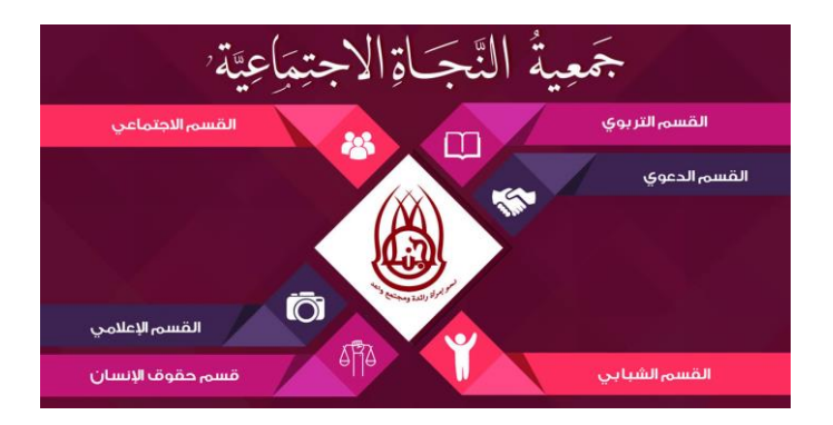
Figure 3: Al-Najat's Divisions

Six divisions operate in al-Najat: da 'wah , social, educational, youth, media, and human rights sections (pictorial information figure 3)