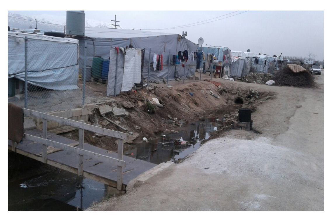
Khaled El-Shaher Camp - Bekaa Valley, Lebanon